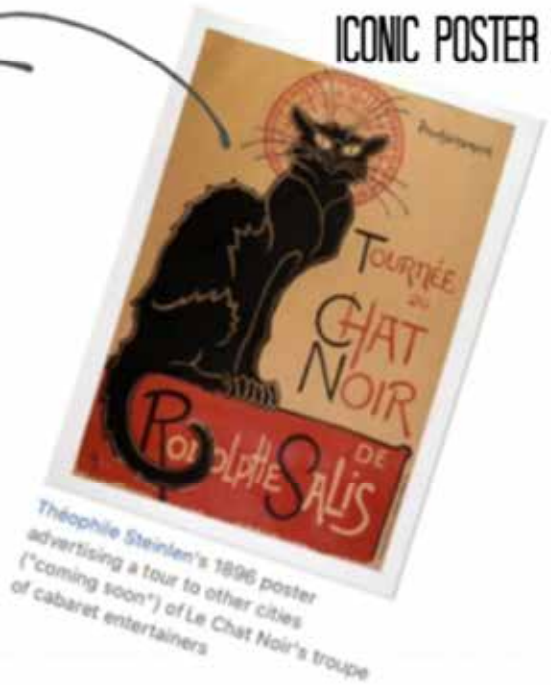
Théophile Steinlen's 1896 poster advertising a tour to other cities ("coming soon") of Le Chat Noir's troupe of cabaret entertainers

POT LUCK STYLE- DRINKS AVAILABLE FOR PURCHASE DURING EVENT-