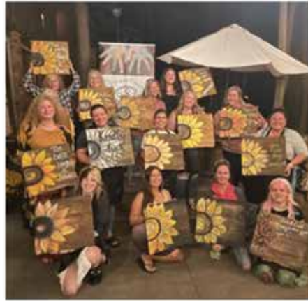
POT LUCK & CASH BAR